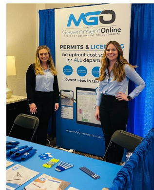
Building Professional Institute