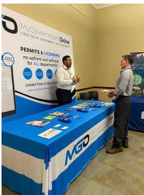
Louisiana Floodplain Management

Our MGO team participates in many conferences, here are just a few of those: