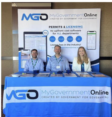
Annual BOAL conference in Lake